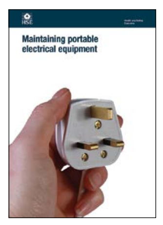
HSG107 (Third edition) Published 2013